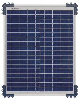
20W Solar Panel