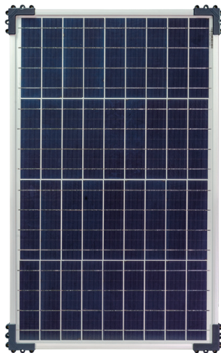
40W Solar Panel