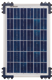
10W Solar Panel