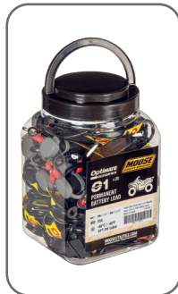
01NM x20 (JAR)