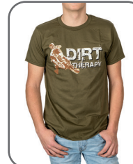
T-SHIRT MILITARY GREEN